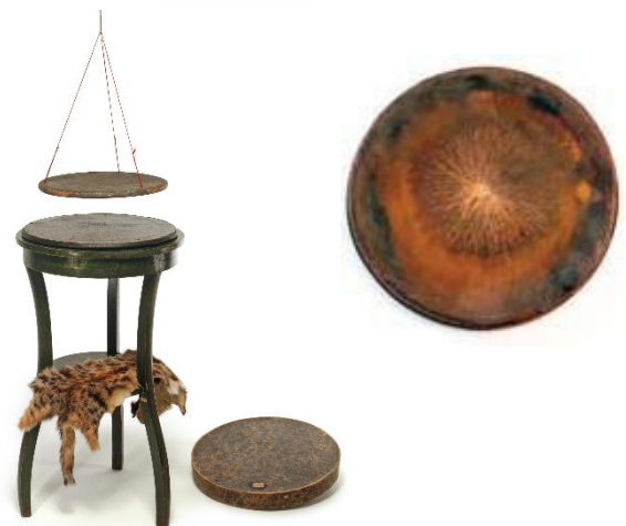
Fig. 3: Electrophorus and cat fur on the left at around 1780. With the tin foil coated wooden plate the charge could be separated and impressive electric sparks up could be generated. Lichtenberg figure for a positive charge on the right.

This was at a time when Wilhelm Eduard Weber (1804-1891) had been appointed as a professor for physics in Göttingen, the former chair of Lichtenberg. As a candidate strongly supported by Gauß, they developed a fruitful collaboration. Weber's novel research field at Göttingen "electromagnetism" was stimulated by Oersted's finding of a force in between live wires. With Weber's experiments (Fig. 6) precise measurements of the strength of the magnetic field in absolute units became possible and his definition of the current is still valid. It allowed Weber and Gauß to realize a unit system connecting electric and magnetic quantities to the basic units of length, time and mass. Webers theory, which he completed in experiments together