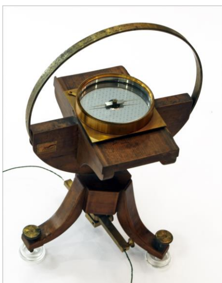
Fig. 6: Weber's instruments to measure the magnetic field generated by the circular current loop from 1837. With the Tangentenbussole (Bussole = compass), sensitive deviations of the needle were determined thus it was the first practical instrument to measure the magnetic field generated by the current through the wire loop. The wiring can be seen at the bottom.

Guided tours with the current curator, Prof. K. Samwer, I. Physics Institute, can be arranged. (Tel: 0551 39-7602, http://www.uni-goettingen.de/de/47114.html ).