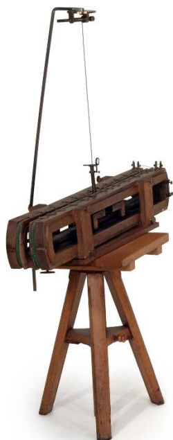
Fig. 7: Gauß-Weber telegraph as shown at the world exhibition in Vienna 1873.