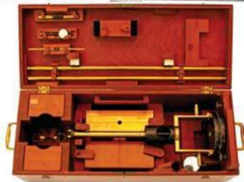
Fig. 5: Transportable magnetometer from Weber (manufactured by Meyerstein Göttingen, 1839). It was motivated by Alexander von Humboldt to map the earth's magnetic field component, which was deduced from 100 experimental stations all over the world and printed in Gauß' and Weber's atlas of the earth's magnetism.