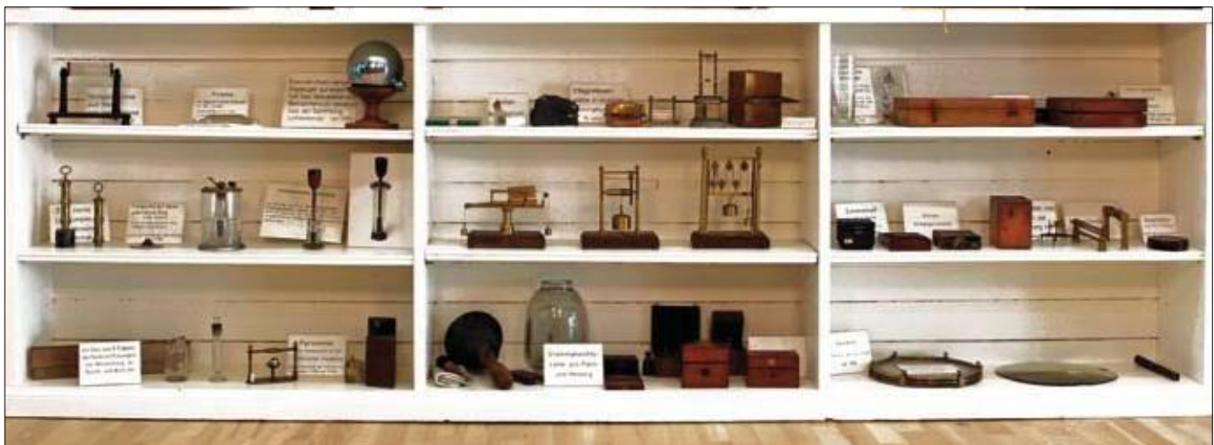
Fig. 1: Historic instruments from Lichtenberg's collection “Physicalische Apparate”, built up in between 1771-1779.