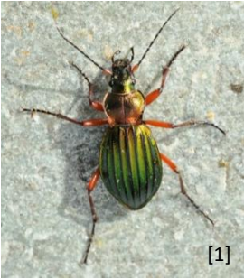
Figure 1: Ground beetle ( Carabus auronitens )

Semi-natural habitats in agricultural landscapes, such as flower fields, can support populations of ecosystem service providers. This includes beneficial agents, such as pest predators, which carry out valuable ecosystem services (e.g. biological pest control).